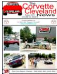
Jan 2005-Dec 2005