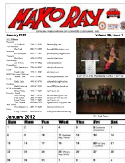
Jan 2012-Dec 2012