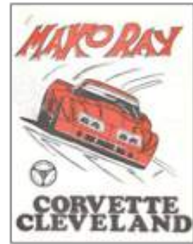
June 1977-Dec 1978