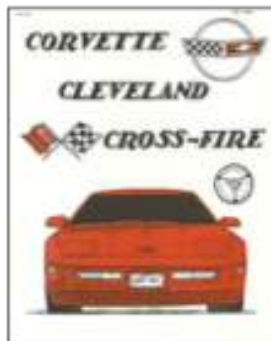
Jan 1984-Dec 1987