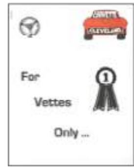
May 1995-Dec 1995