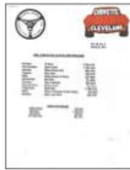
Jan 1988-April 1995