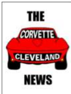
April 1999-Dec 2004