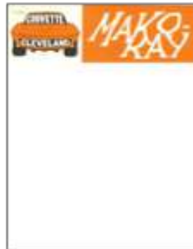
April 1968-May 1977