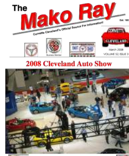
Jan 2008-Dec 2008