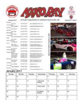
Jan 2017-Dec 2017