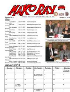
Jan 2013-Dec 2016