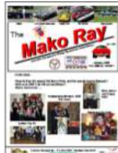
Jan 2006-Dec 2007