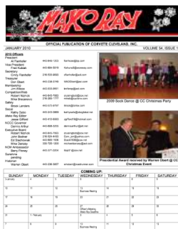
Jan 2010-Dec 2010