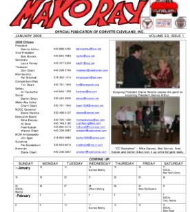
Jan 2009-Dec 2009