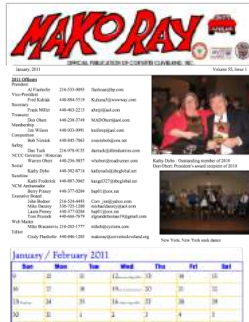
Jan 2011-Dec 2011